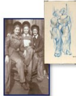
Visual materials photographs, drawings, scrapbooks

The Project collects first-hand accounts of U.S. Veterans from the following wars: